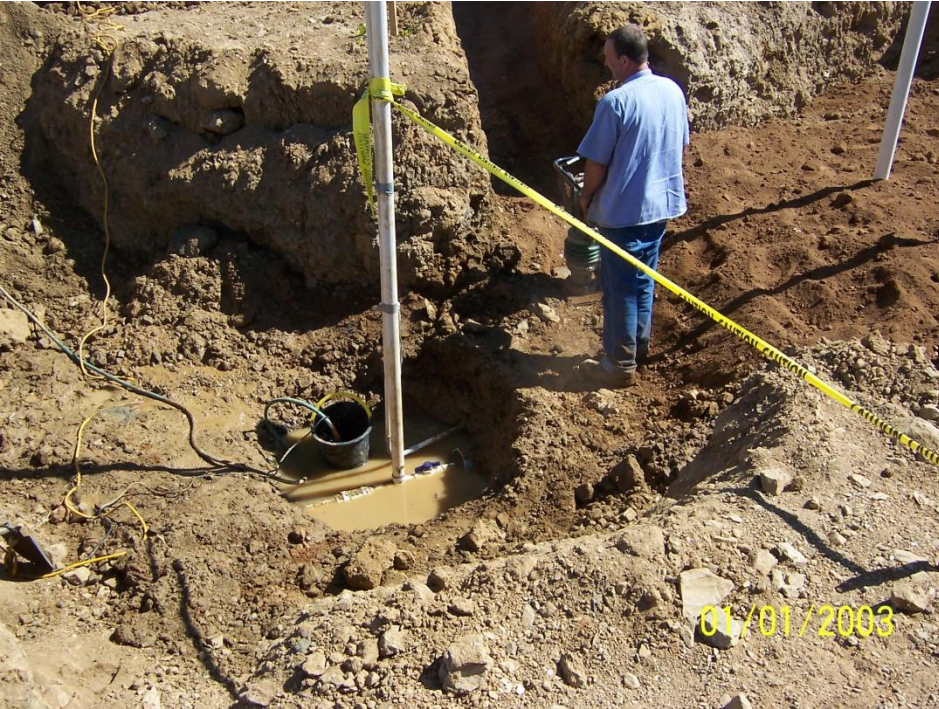
Building of Dam